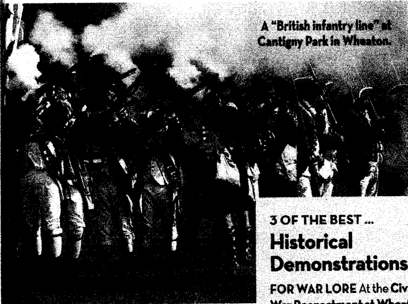
A "British infantry line" at Cantigny Park in Wheaton.